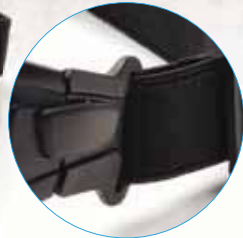
Quick Release Interchangeable Temples and Strap.

Sporty, lightweight design eliminates the bulkiness and weight of a goggle.