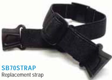
SB70STRAP Replacement strap