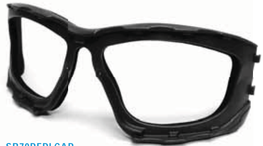
SB70REPLCAR Replacement foam carriage